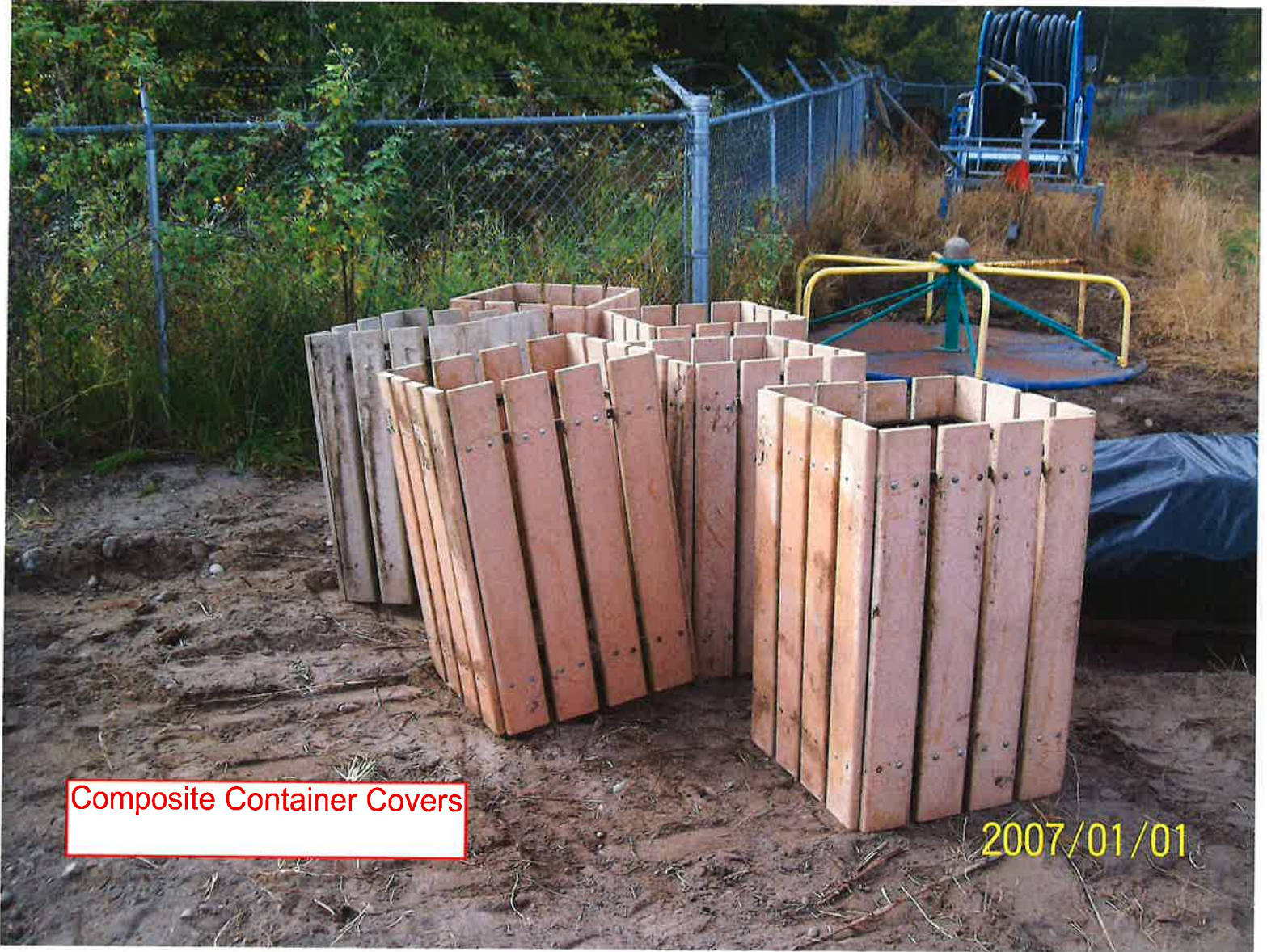
Composite Container Covers