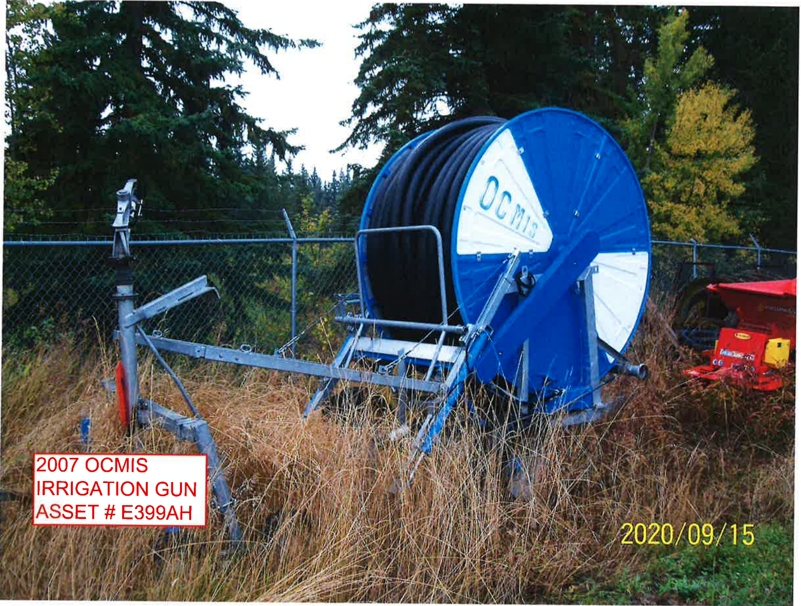
2007 OCMIS IRRIGATION GUN ASSET # E399AH