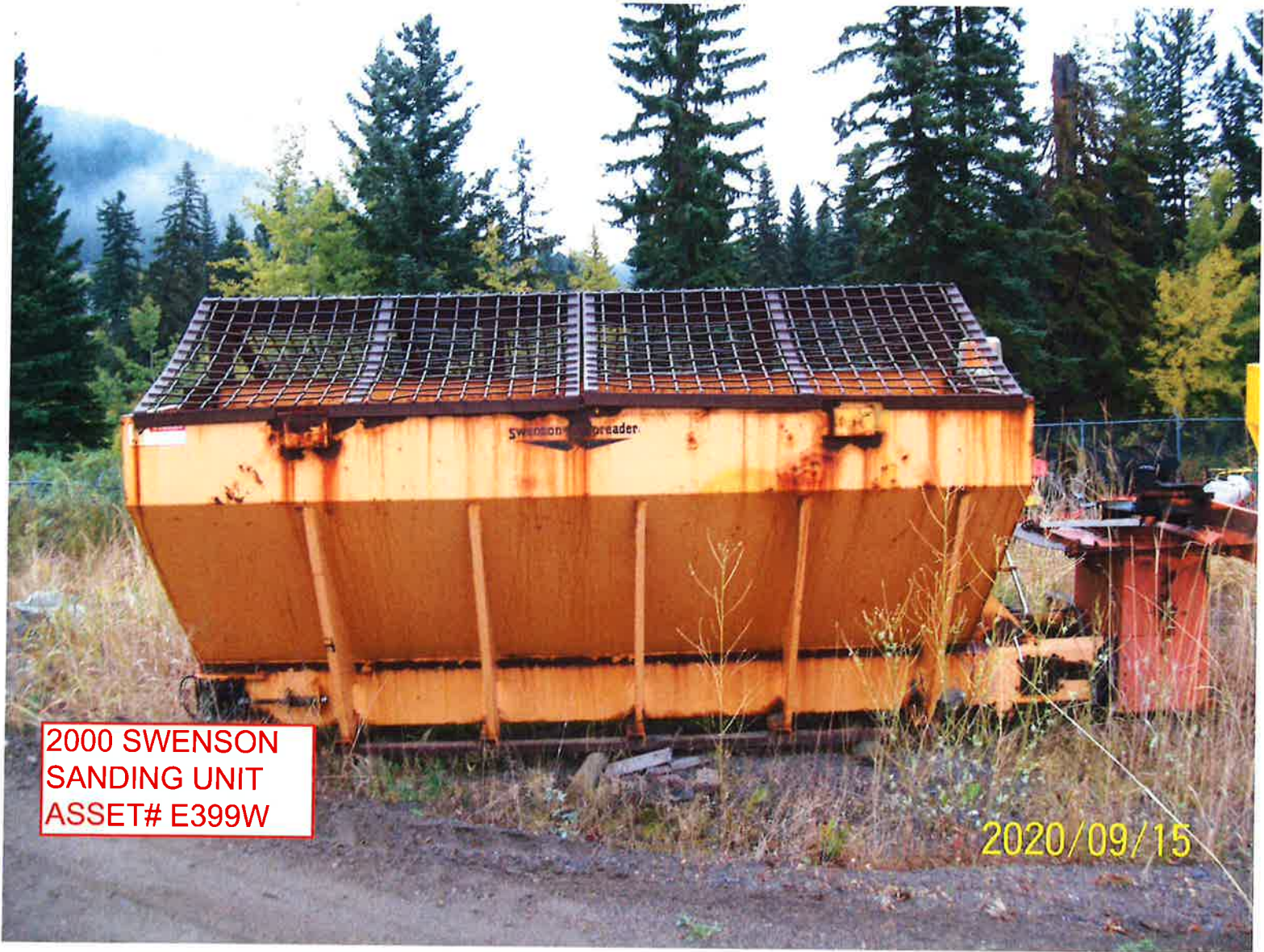
2000 SWENSON SANDING UNIT ASSET# E399W