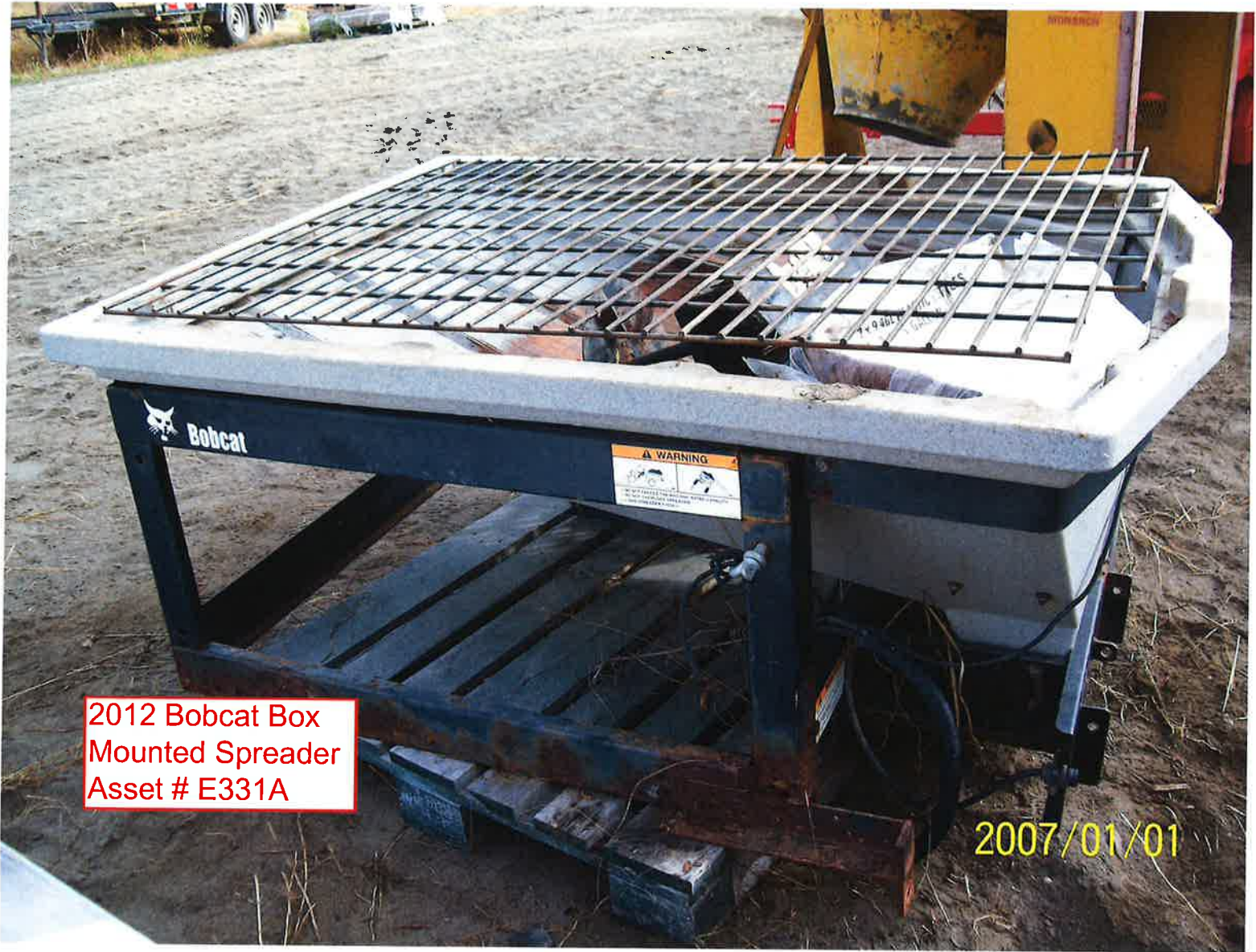
2012 Bobcat Box Mounted Spreader Asset # E331A