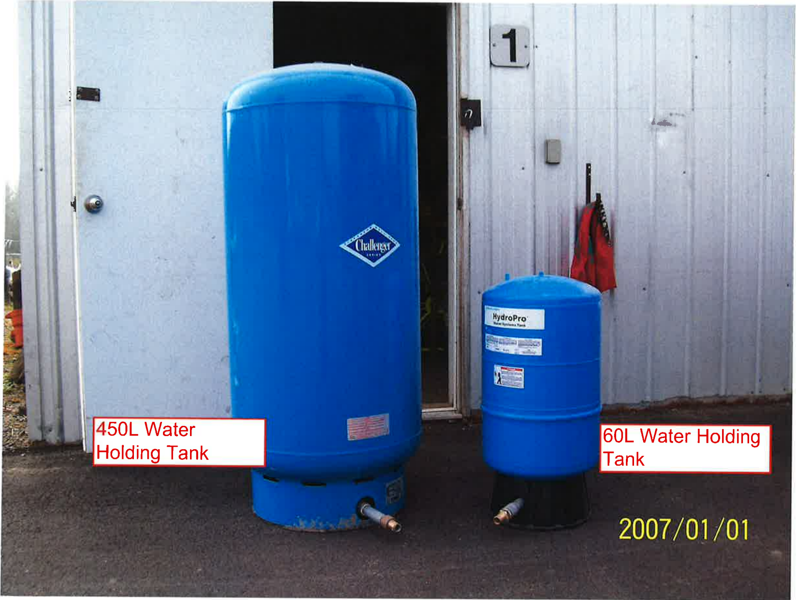
450L Water Holding Tank